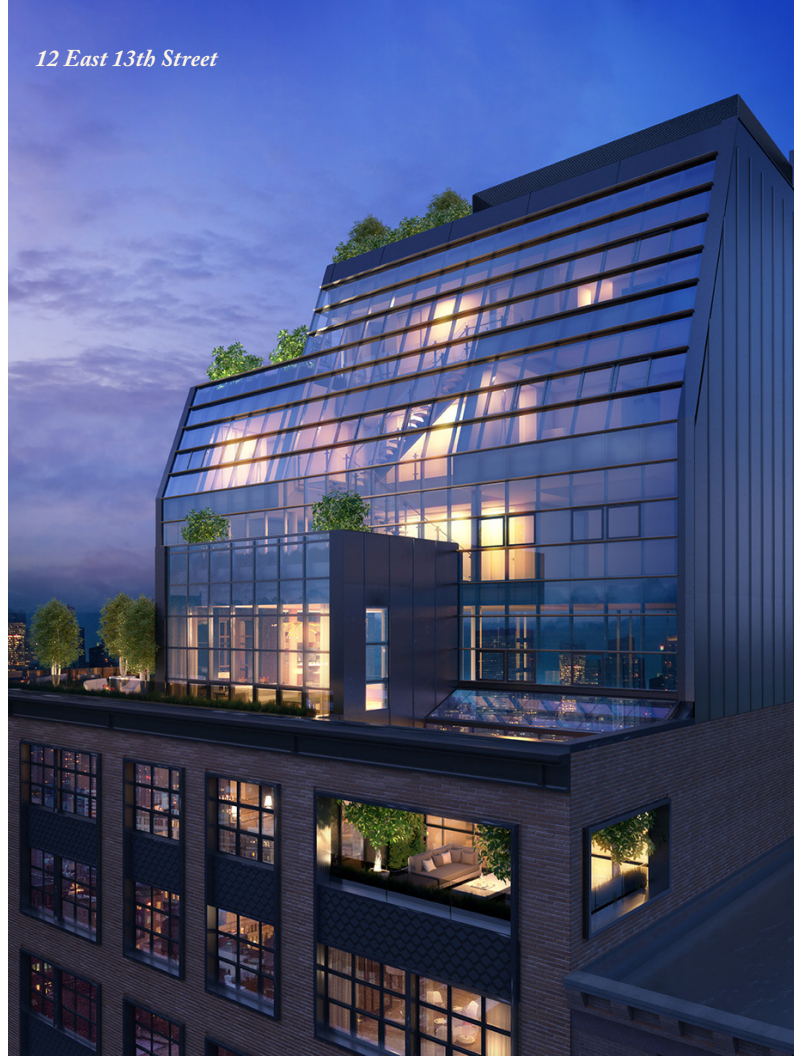
12 East 13th Street