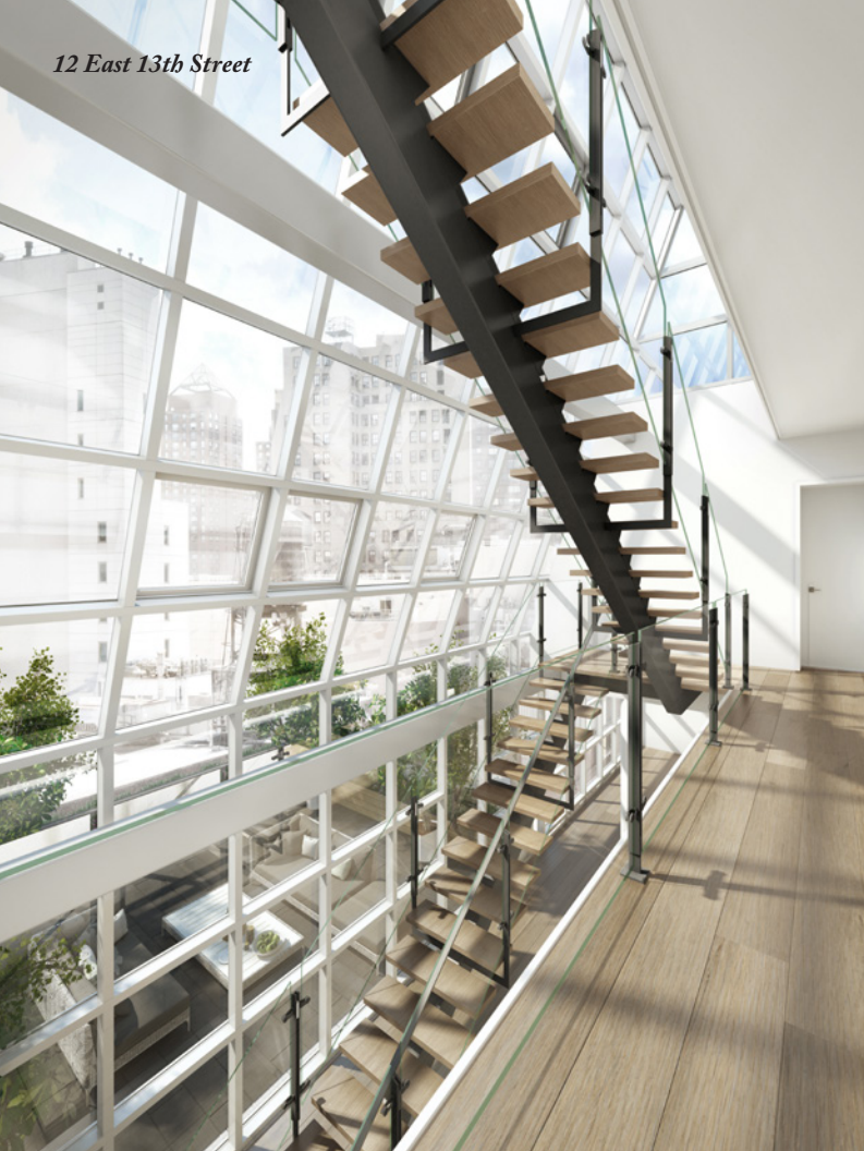
12 East 13th Street