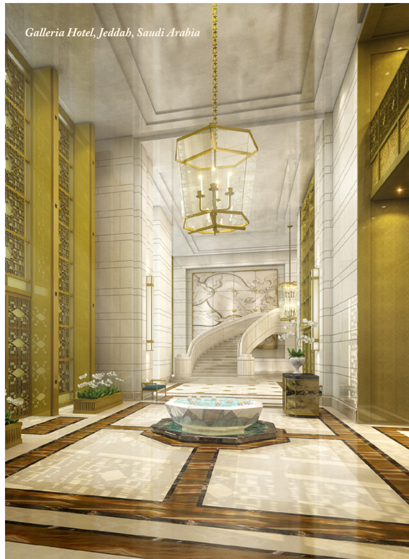
Galleria Hotel, Jeddah, Saudi Arabia